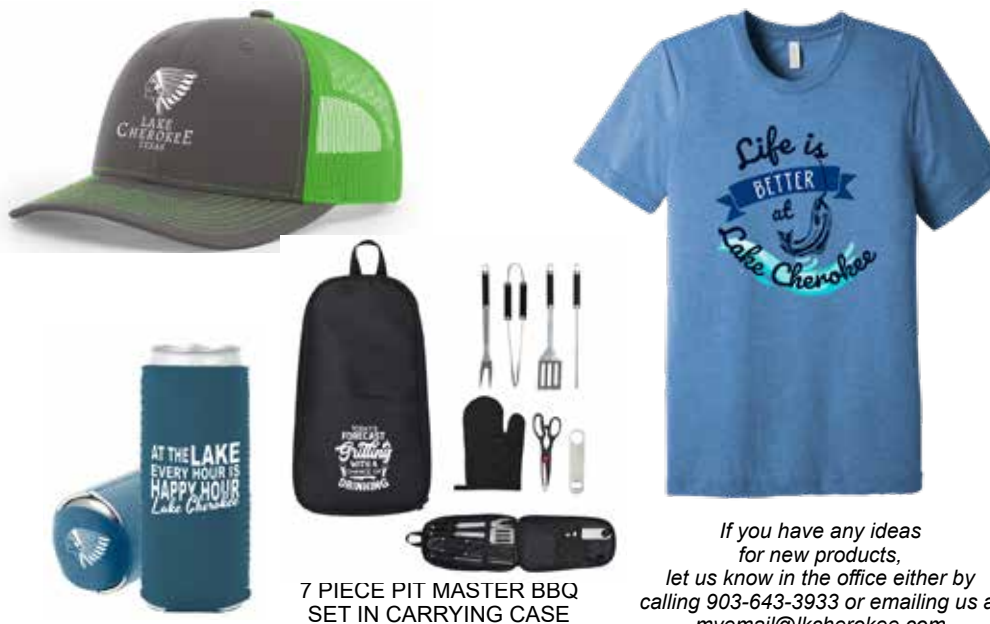
7 PIECE PIT MASTER BBQ SET IN CARRYING CASE

If you have any ideas for new products, let us know in the office either by calling 903-643-3933 or emailing us at myemail@lkcherokee.com