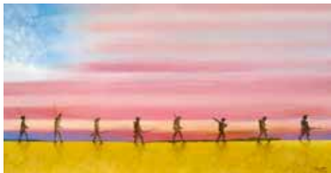
Steve Alpert, “Legacy,” depicting foot soldiers from eight different eras of the U.S. Army. https://www.stevealpertart.com/artwork/legacy .

Returning US servicemen and women were treated differently depending on the era. While WWII veterans were fully supported at home and glorified