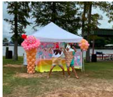
Family Fun Fest 8/31/24