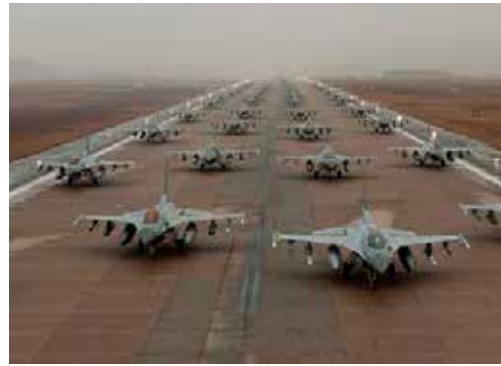
An “Elephant Walk” is a display of aircraft in tight formation (nose-to-tail) right before takeoff (as in this image).