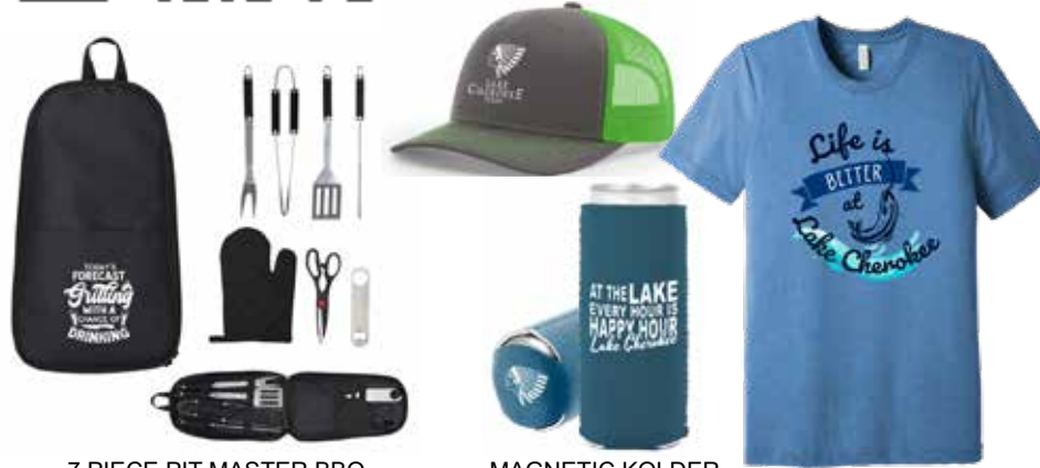
7 PIECE PIT MASTER BBQ SET IN CARRYING CASE

Use your camera to scan the QR code to go directly to the online store.