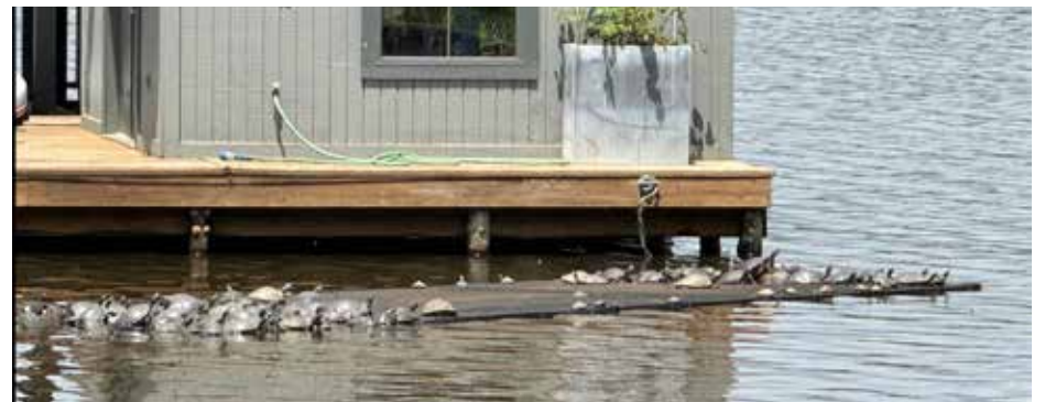
Sandy Kay Keaton

FACILITY CHECK: 1217 CLEAR ROADWAY OF TREES/DBRIS: 21 OPEN DOOR: 1 EXTRA PATROL: 101 SUSPICIOUS VEHICLE/ PERSON: 11 ALARMS: 11 WELFARE CHECK: 4 WATER RESPONSE/ BOAT TOW: 7 ASSIST SHAREHOLDER: 16 CODE VIOLATIONS: 1 ISSUE TREE PERMIT: 33 ASSIST AGENCY: 8 ANIMAL ASSIST: 6