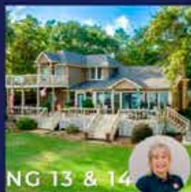
NG 13 & 14