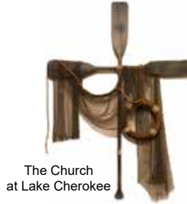
The Church at Lake Cherokee

Saturday, July 6th Boat Parade 10:00 AM Fireworks Show at Dark